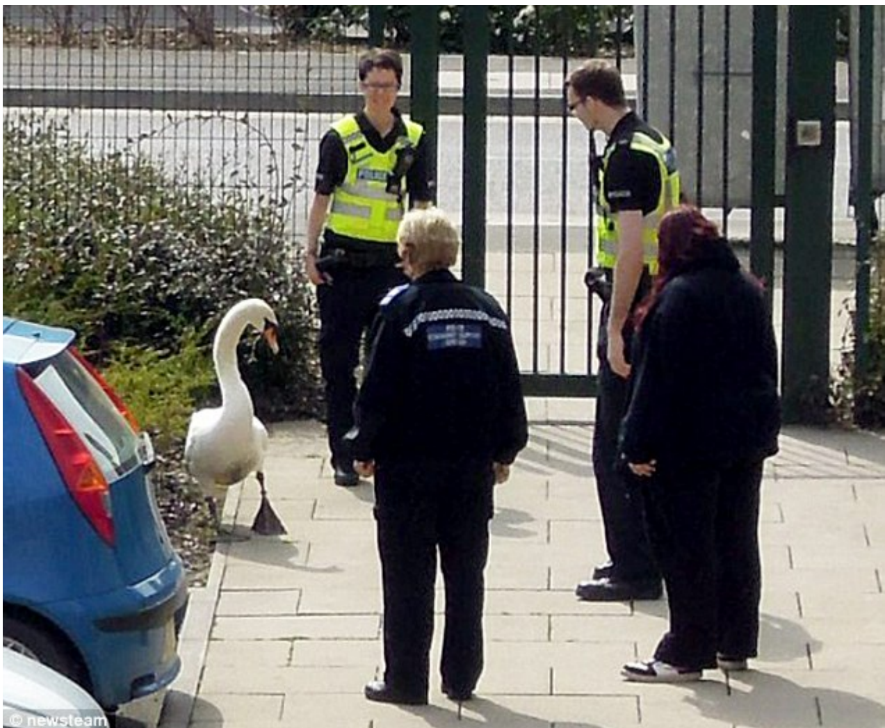
Cornered: Three police officers and a member of the public have the swan surrounded

'It wasn't doing anyone any harm and I wonder what crimes might have taken place while they were messing around with a swan.'