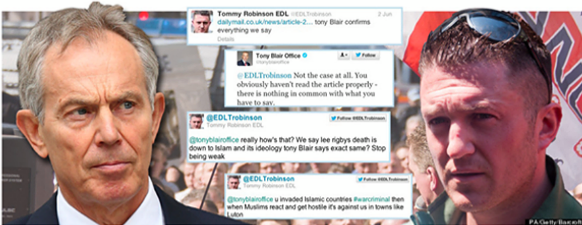
War Of Words After Robinson Endorses Blair's Article 'Criticising Islam'

Former Prime Minister Embroiled In Twitter Spat With EDL Leader